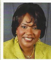
Rev. Dr. Bernice A. King