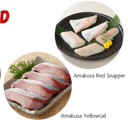
Amakusa Red Snapper