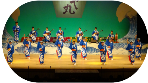
Ushibuka Haiya - Ushibuka High School Students

Montana's longstanding sister-state relationship with Kumamoto Prefecture in southern Japan is supporting the Japan Festival in that Kumamoto Prefecture and Amakusa City provided funding for Japanese high school student dancers to travel to Billings to provide traditional dance performances and workshops, in addition to supplying fresh yellowtail and snapper to be served during the festival in Rimrock café. The fresh fish is limited to the first 100 servings, so don't miss out!