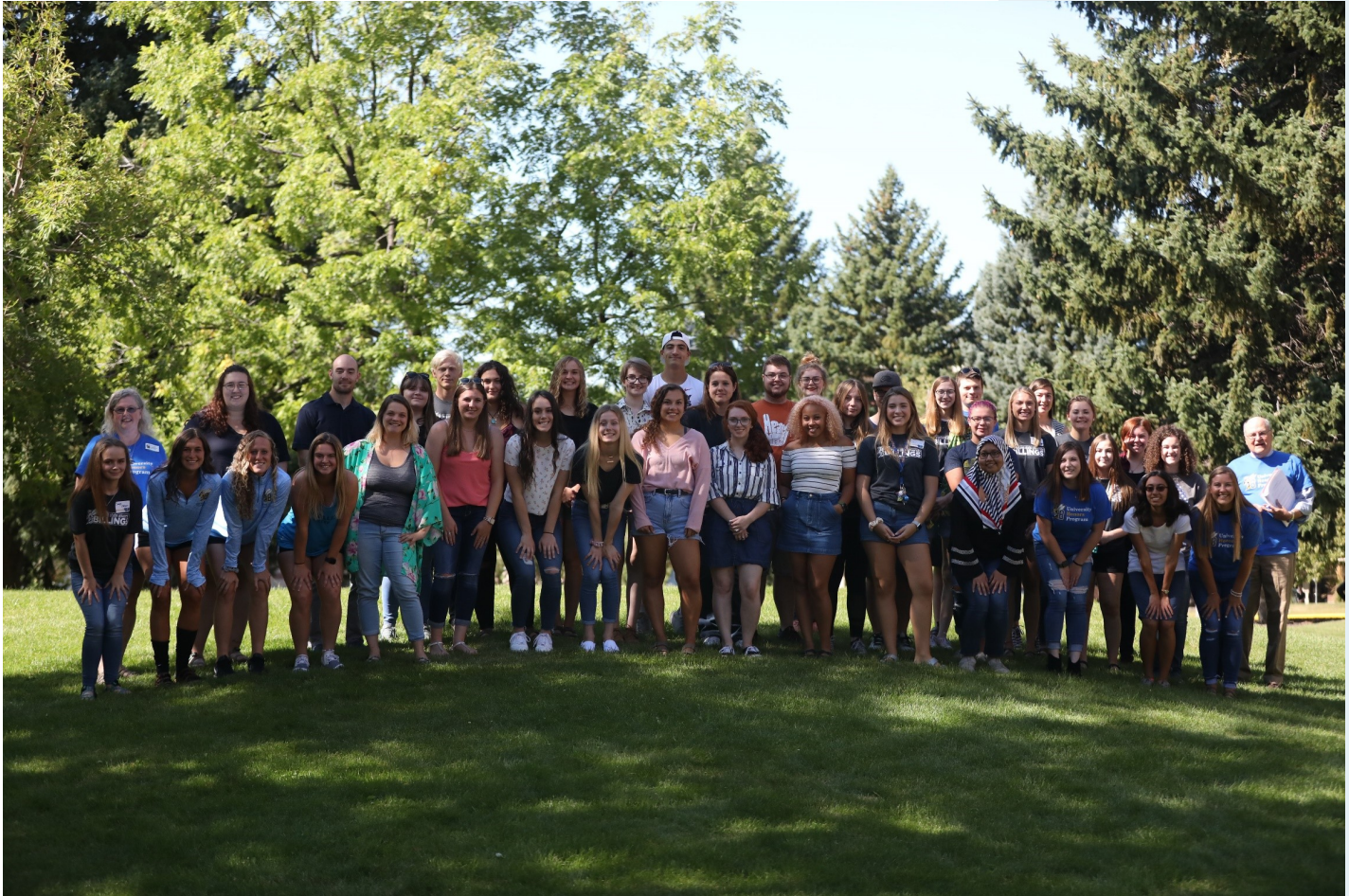
Group photo from 2019 Honors Orientation