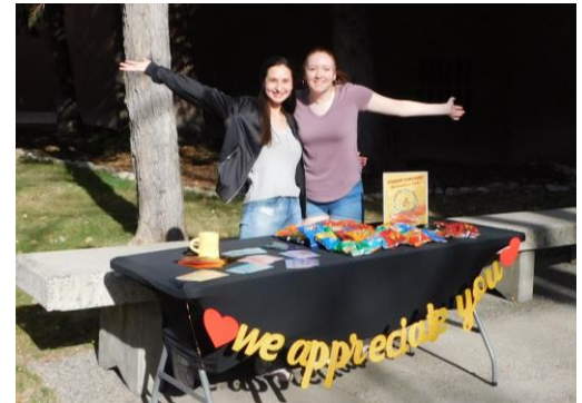
Student Employee Appreciation Week