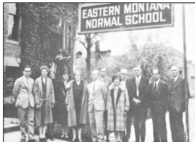
1927 faculty of Eastern Montana Normal School

Plan to join us on the campus of MSU-Billings in July to celebrate the 75 th anniversary of our campus and enjoy the great times you had as a student. It will be a weekend you won't forget! See you at the Reunion!