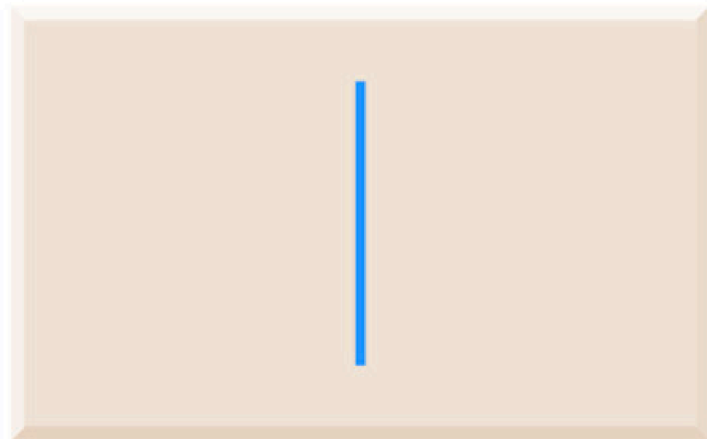
A. Standard line