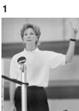
1 Point (Winner of rally)