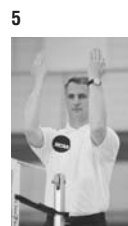
5 Ball out of bounds, ball illegally outside antenna or player illegally in adjacent court. [Referees and Line Judges without flags]