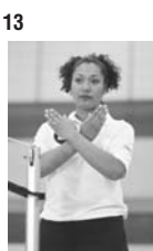
13 End of game or match Blocked from seeing the ball land [Line Judge]