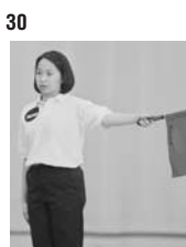
30 First contact or block trav- els over or outside the antenna [Line Judge]