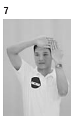
7 Ball out of bounds after contact with a player [Referees and Line Judges without flags]