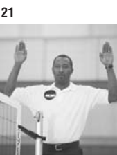
21 Illegal block or screen