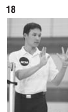
18 Delay of service