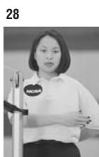
28 Change of courts