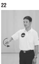
22 Player posi- tional fault, wrong server, wrong position entry, or illegal player in game