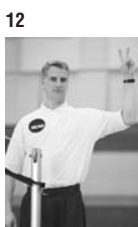
12 Ball illegally contacted more than once by a player