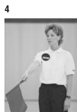
4 Ball in bounds [Line Judge]