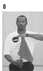
8 Ball out of bounds after contact with a player [Line Judge]