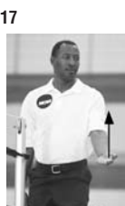
17 Illegal service or ball not released at time of ser- vice