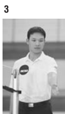
3 Ball in bounds. [Referees]