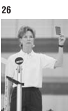
26 Individual sanctions [First Referee]