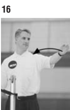
16 Authorization for service