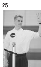
25 Ball con- tacted more than three times by a team