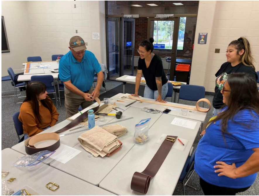
Photo File Name: Nativeweek.jpg Photo Caption: NAAC Events, American Indian Heritage Week