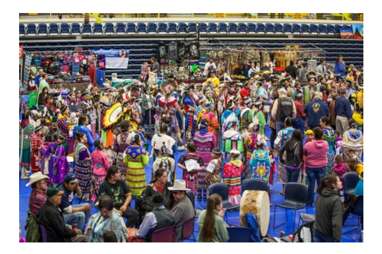
Photo File Name: powwow_wideshot.jpg Photo Caption (include the name of the event/persons, location, date): MSUB powwow, Alterowitz gym, 4/5/2014.